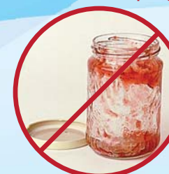
Containers with Food