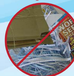
Paper & Cardboard