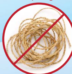
String & Rope