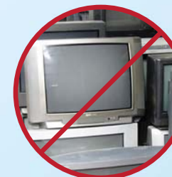
TV's and Electronics