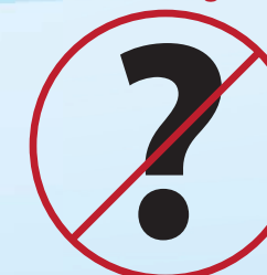
If in doubt... find out!