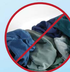
Clothing & Textiles