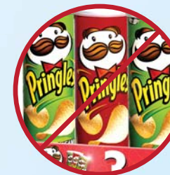
Pringles or Similar