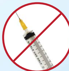
Sharps & Needles