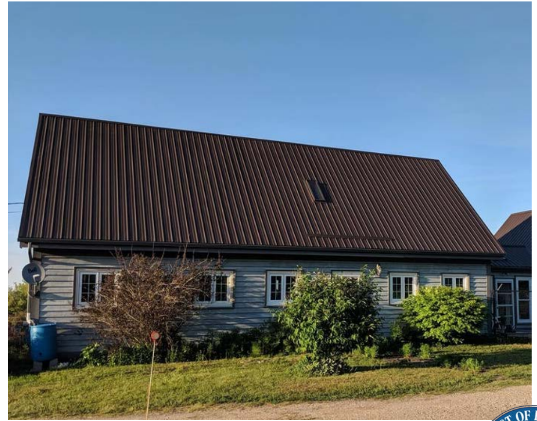
Proposed Roof Design (Example)