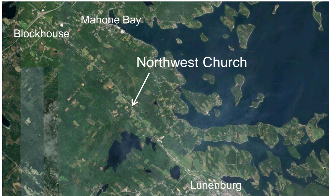
General Site Location