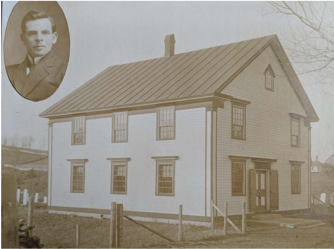
Northwest United Baptist Church (1914)