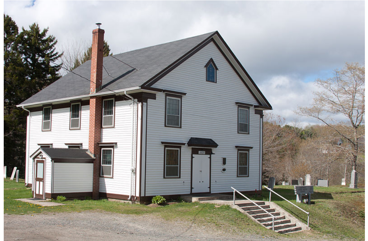
Northwest United Baptist Church (2019)