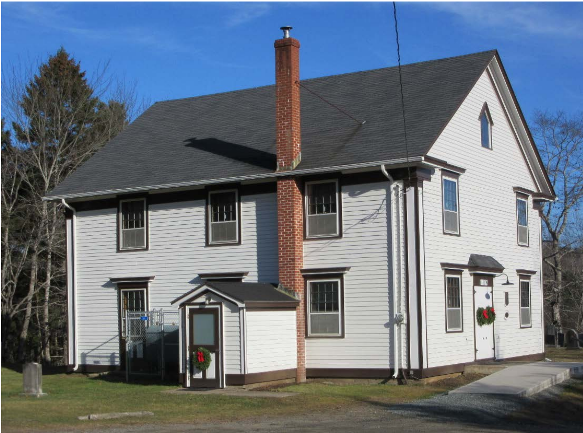
Northwest United Baptist Church (Current)